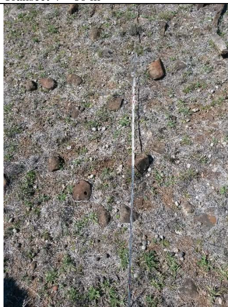
Transect 4 – 70 m