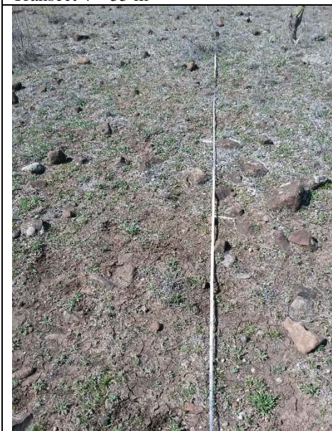
Transect 4 – 65 m