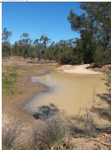
Sediment Pond (236638E, 6744824S)