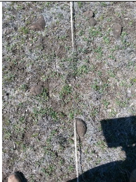
Transect 4 – 10 m