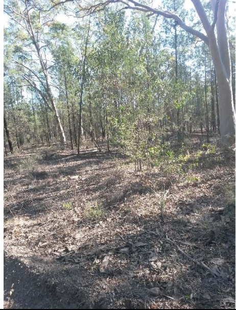
Vegetation within the road side reserve of Bullala National Park.