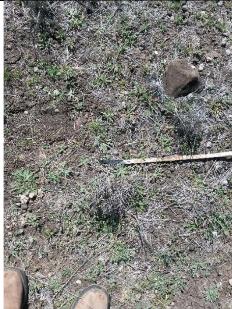
Transect 4 – 0 m