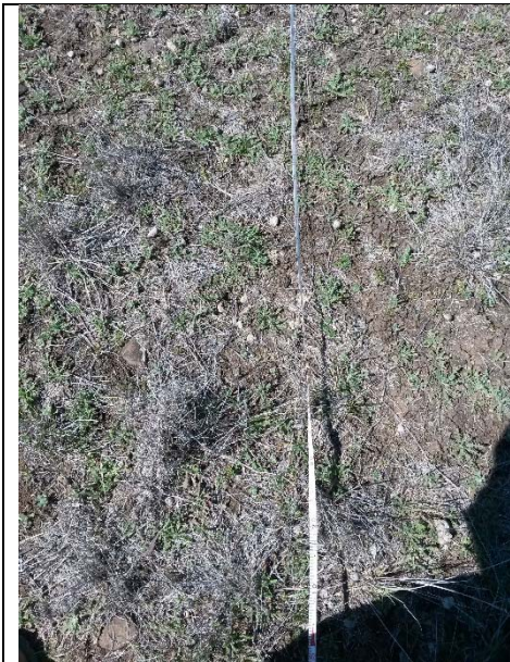
Transect 4 – 25 m