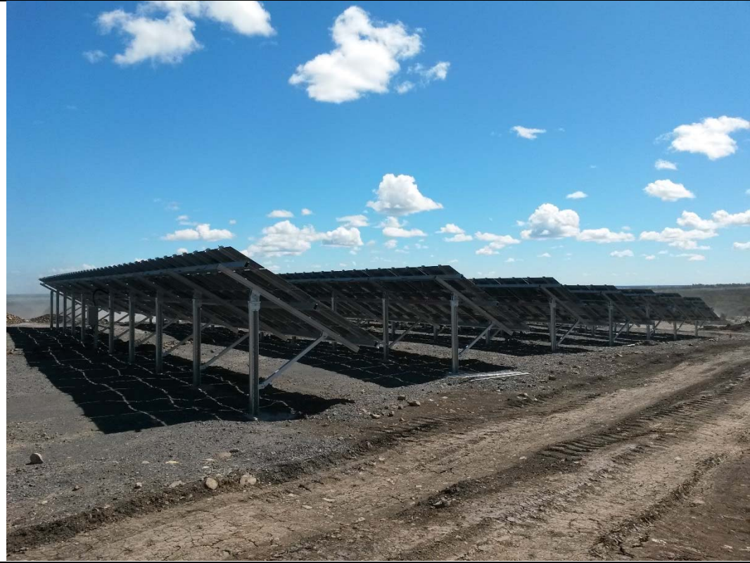
Seven Rows of Solar Panels (237014 E, 6744940 S) on the southern edge of the quarry.