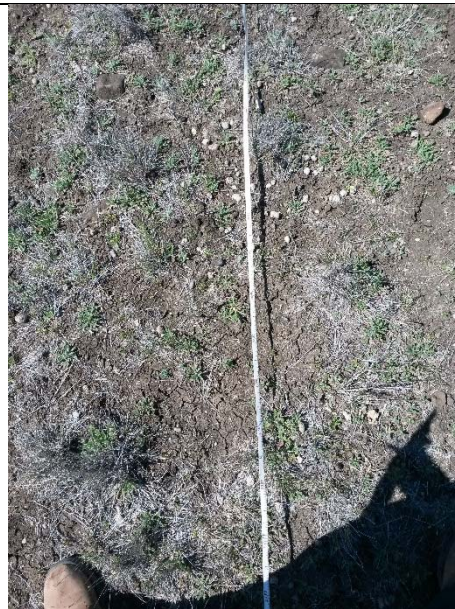
Transect 4 – 30 m