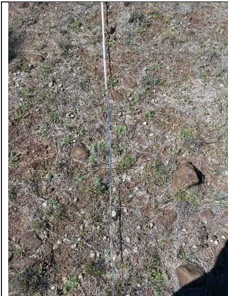
Transect 4 – 85 m