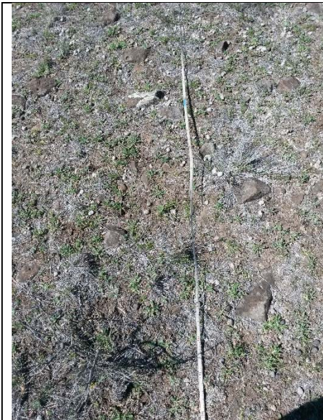
Transect 4 – 55 m