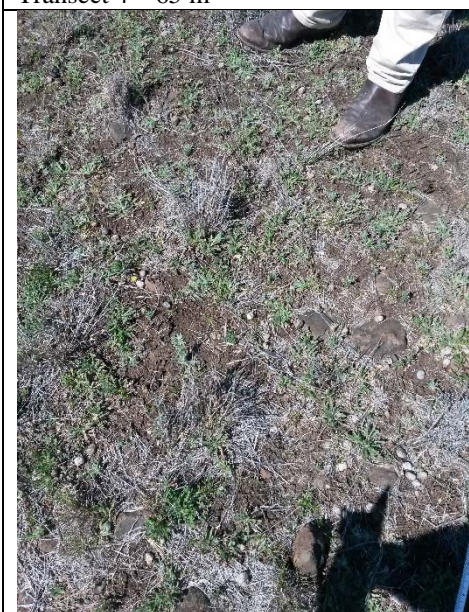
Transect 4 – 75 m