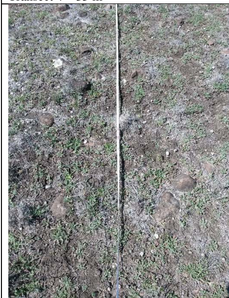
Transect 4 – 45 m