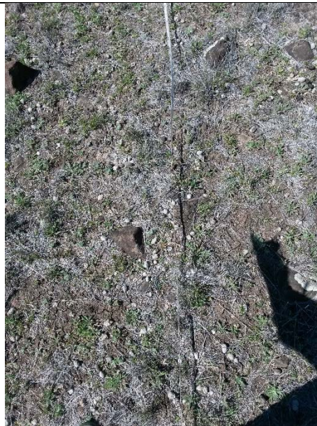
Transect 4 – 60 m