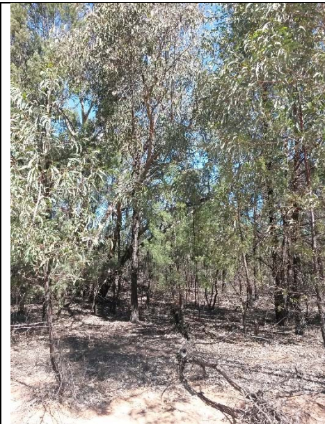
Vegetation on sandy soils