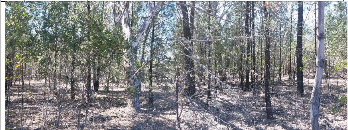
Dirty Gum Pine Smooth-barked Apple open Forest RCV (237228E, 6745712S)