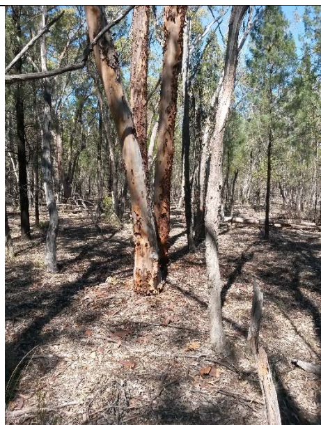
Vegetation within Transect 1