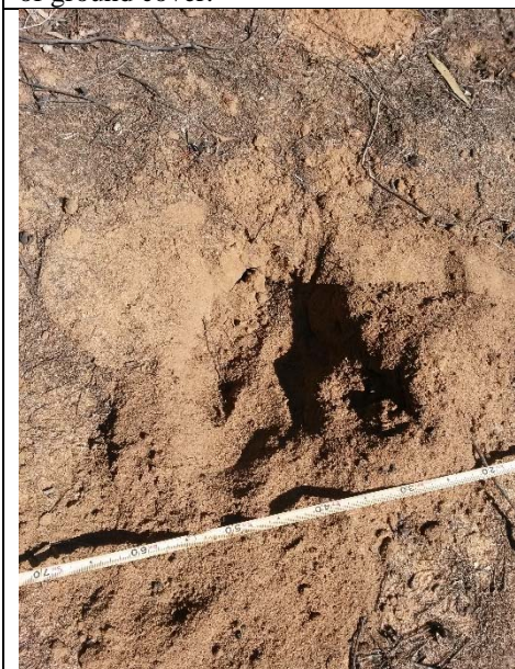
Animal diggings within Transect 1