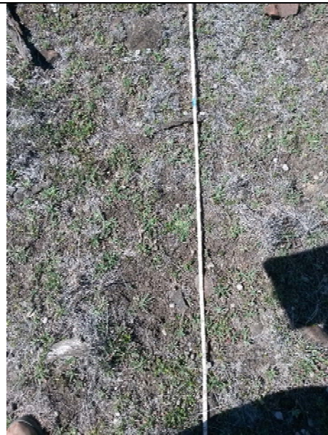
Transect 4 – 5 m