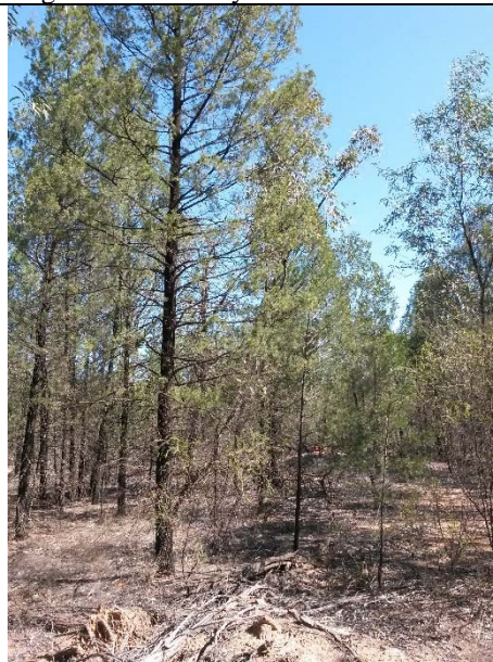
Vegetation on sandy soils