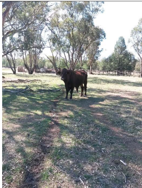
Grazing area with bore, stock yards, dams