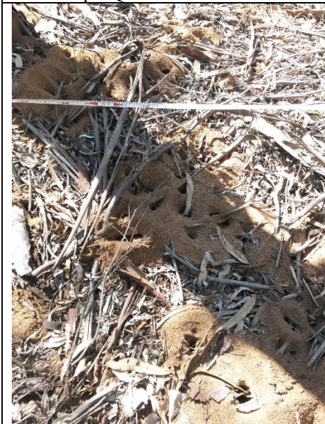
Ants Nest within Transect 1, showing lack of ground cover.