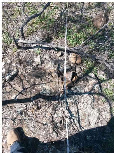
Transect 4 – 20 m