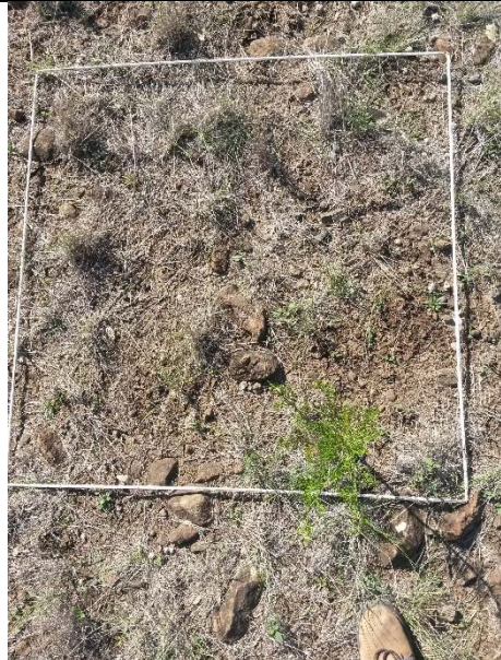
1 m 2 Sample Quadrant