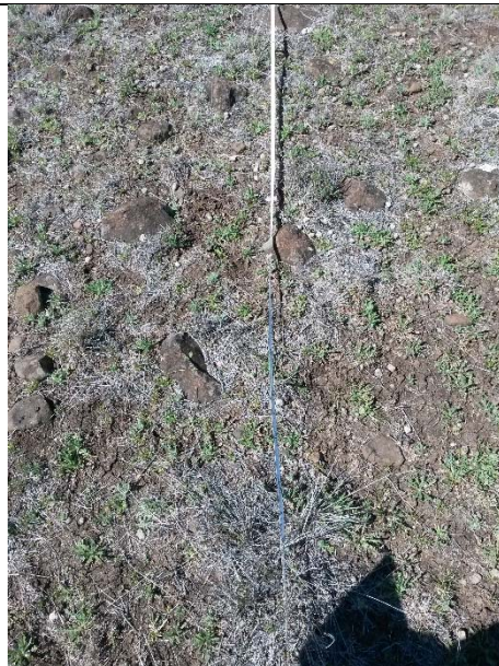
Transect 4 – 90 m