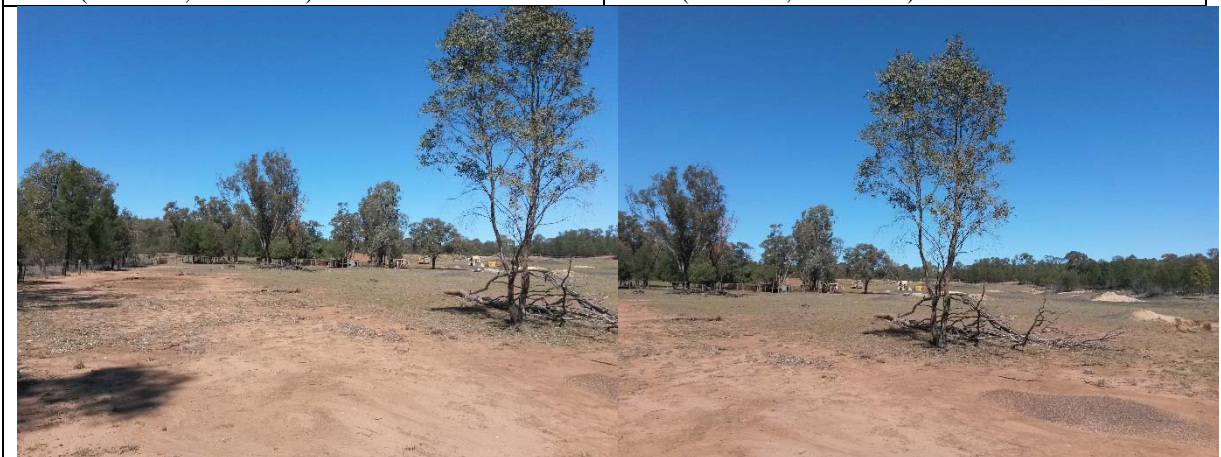
Open Grazing land