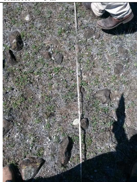
Transect 4 – 15 m