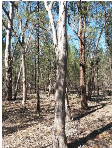
Vegetation within Transect 1