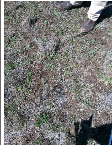
Transect 4 – 95m