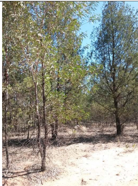
Vegetation on sandy soil