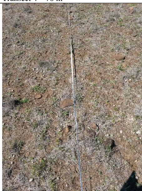
Transect 4 – 80 m