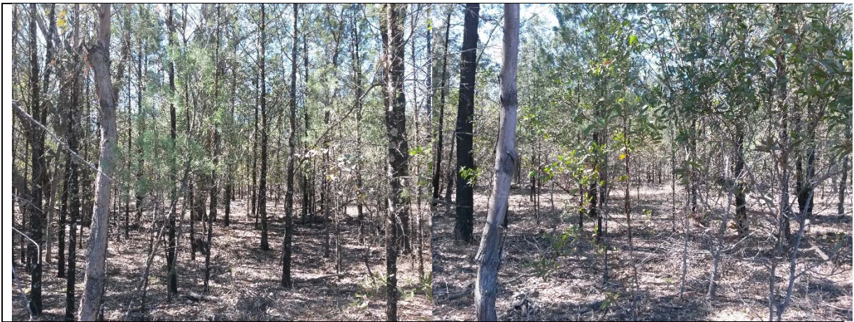
Dirty Gum Pine Smooth-barked Apple open Forest RCV (237228E, 6745712S)