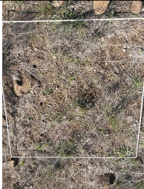
1 m 2 Sample Quadrant