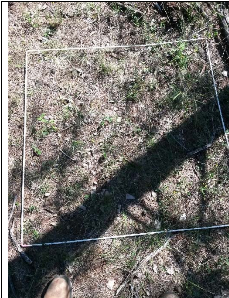
1 m 2 Sample Quadrant