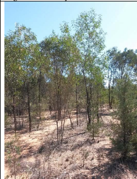
Vegetation on sandy soils