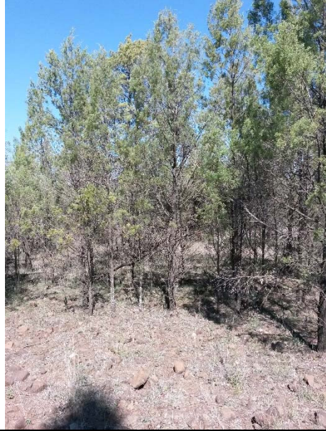
Cypress Pine in the White Box – Pine – Silver Leaved Ironbark shrubby open forest to the north of the disturbance area.